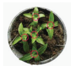
Before First Pinching

Pinching should be done in the morning 14 days after transplant above 2 pairs of true leaves.