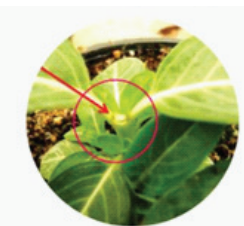
After First Pinching